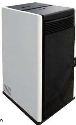
Alize 15 kW

With the easy-to-use cleaning arm, the moving grate extends the cleaning period without the need to open the front door. The Alizé series of products also consider the cleanliness of your home as much as your pocket.